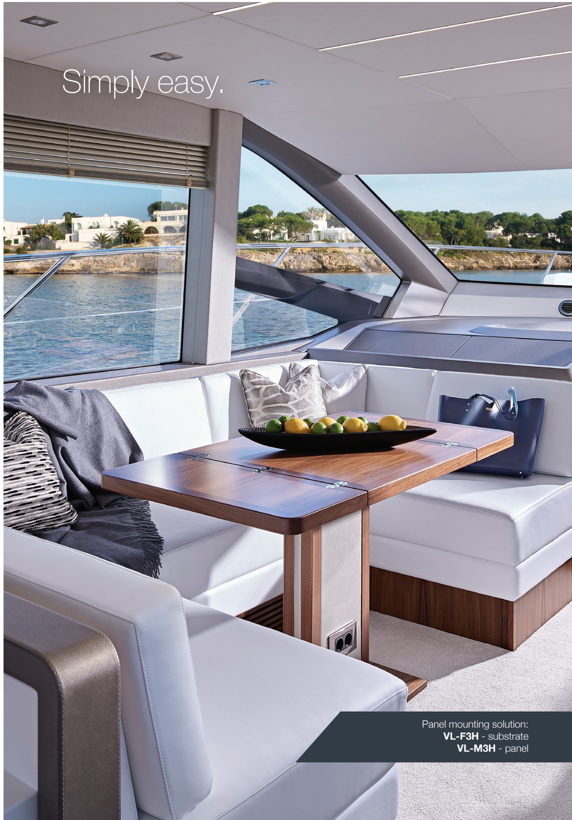
Panel mounting solution: VL-F3H - substrate VL-M3H - panel