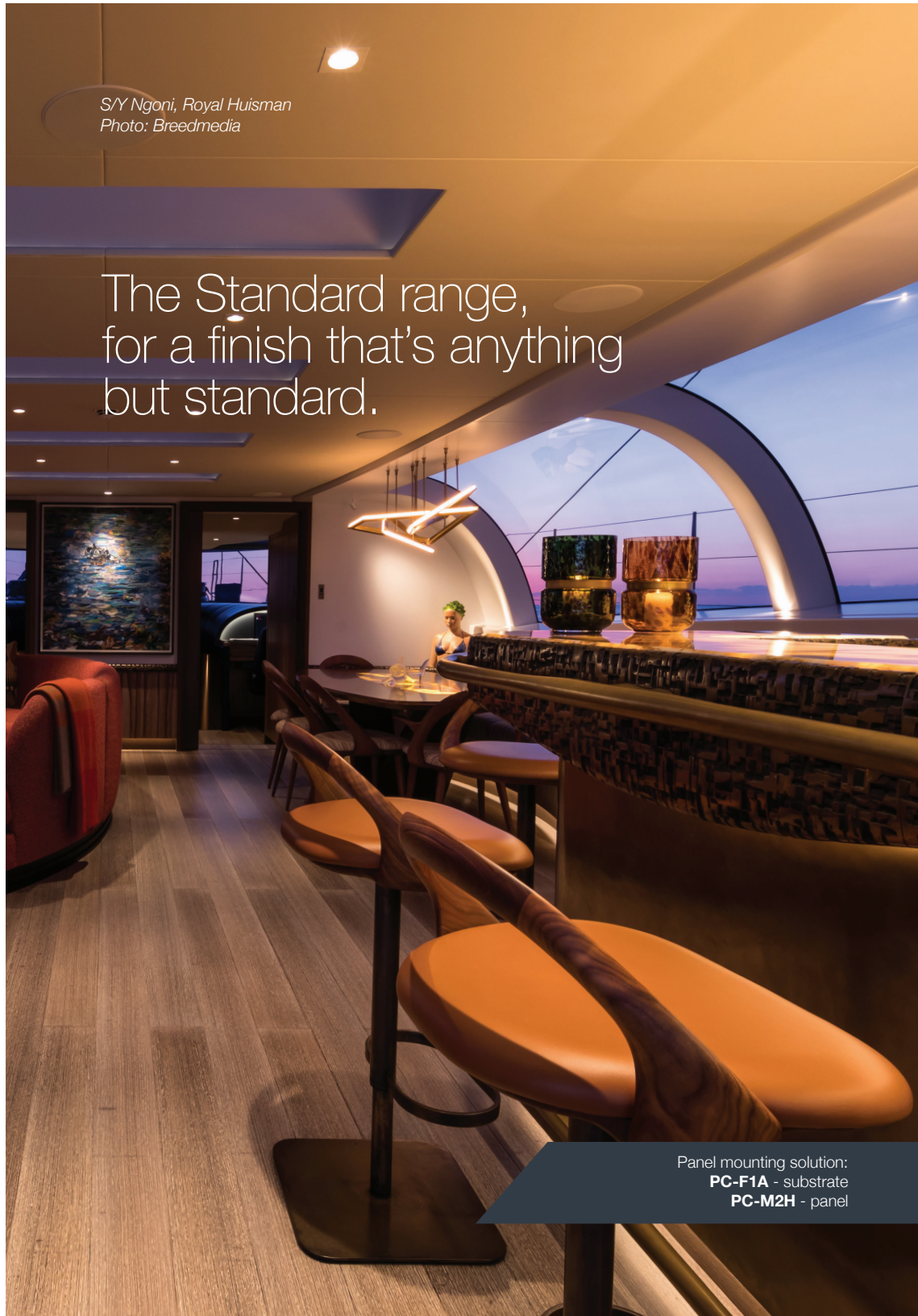
Panel mounting solution: PC-F1A - substrate PC-M2H - panel

The Standard range, for a finish that's anything but standard.